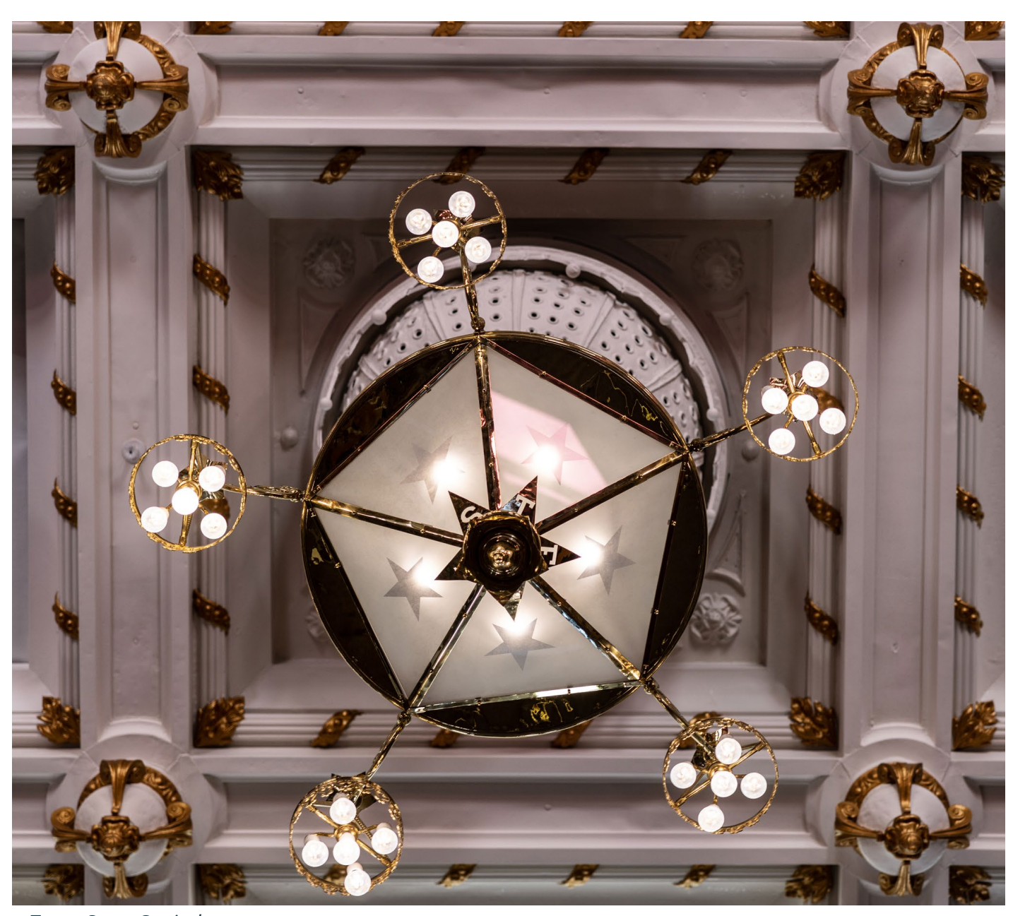
Texas State Capitol